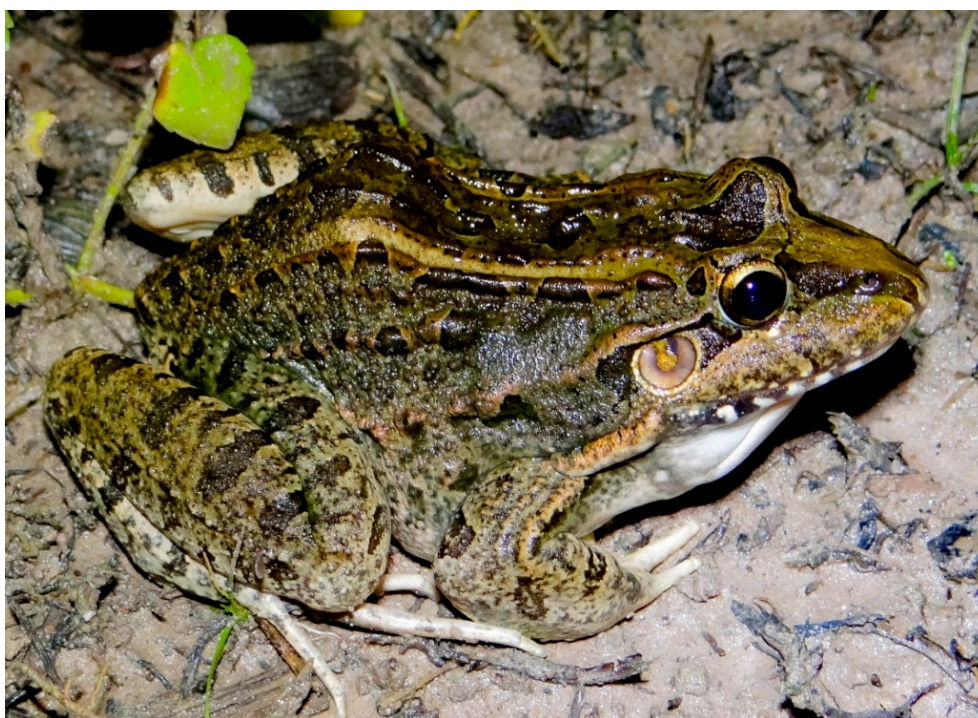
FIGURE 2: Individual from Leptodactylus macrosternum.